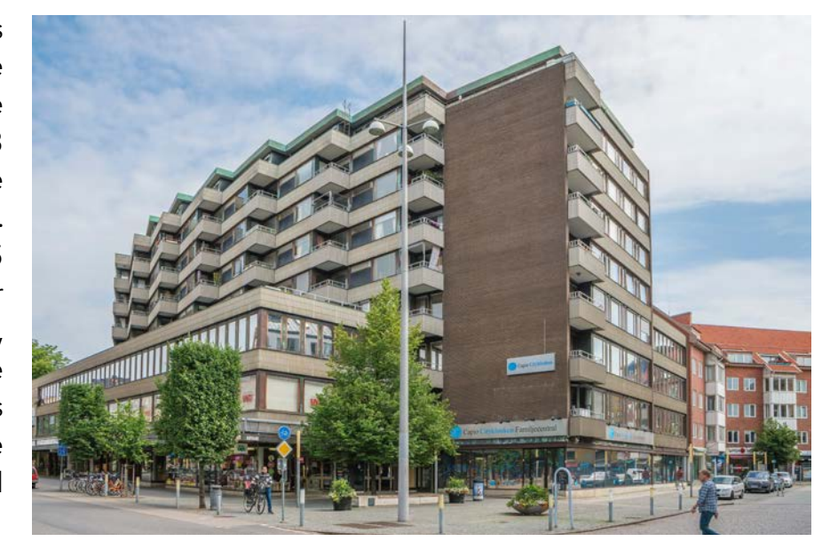
Page 5 of 14

In May a large property was acquired from Wihlborgs in the city center of Helsingborg. The property consist of 33 apartments and 6 237 square meters of commercial space. The purchasing price was 187,5 MSEK and some of the larger tenants are Capio Cityklinik, Tingsrätten and The Helsingborg Municipality. This property is located next to the Groups large commercial center, Holland 25.